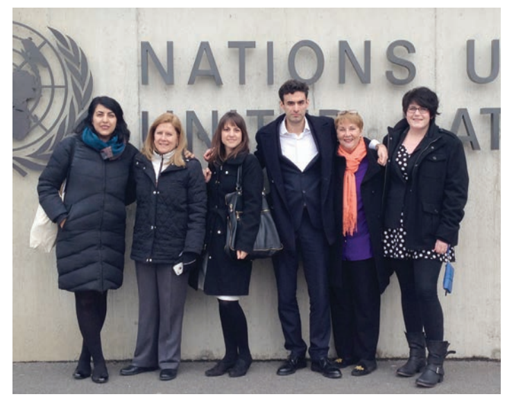
CCR and SNAP team at the UN Committee on the Rights of the Child hearing in Geneva.

CCR and SNAP will also be submitting a report to a