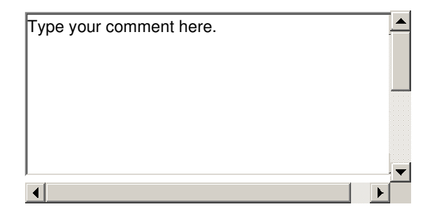
Showing 1 of 1 Comment