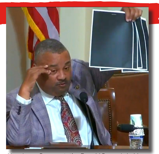
New Jersey Representative Donald Payne Jr. holds up redacted copies of the DHS "race paper" during a Congressional hearing on domestic terrorism.